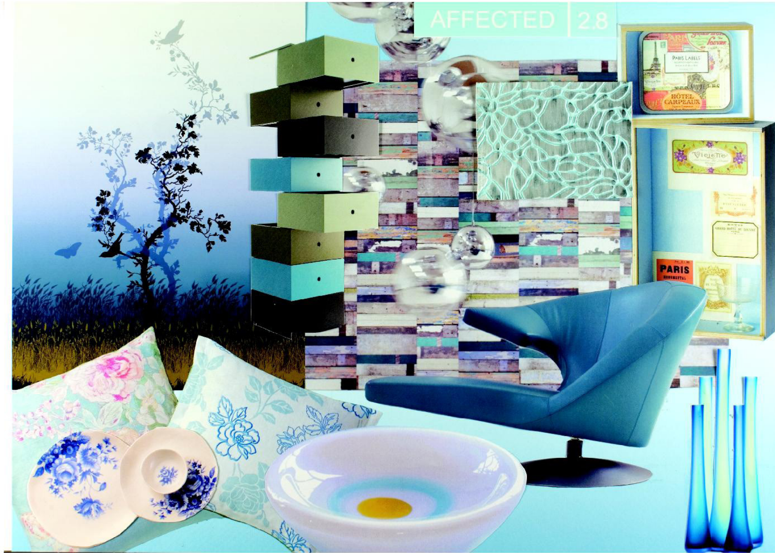
AFFECTED | 2.8

2.8 - Several shades of blue and green are combined here, to show an old recycled effect. On the right we see a beautiful wallpaper, a layered print with twigs and birds by Timorous Beasties from England. The multicolour drawer set is a design by Tadeo Hoshino for Ligne Roset. The metallic silver/blue flower print is from the collection of Nachick. The blue glassware on the right is by Tsunami Glassworks.