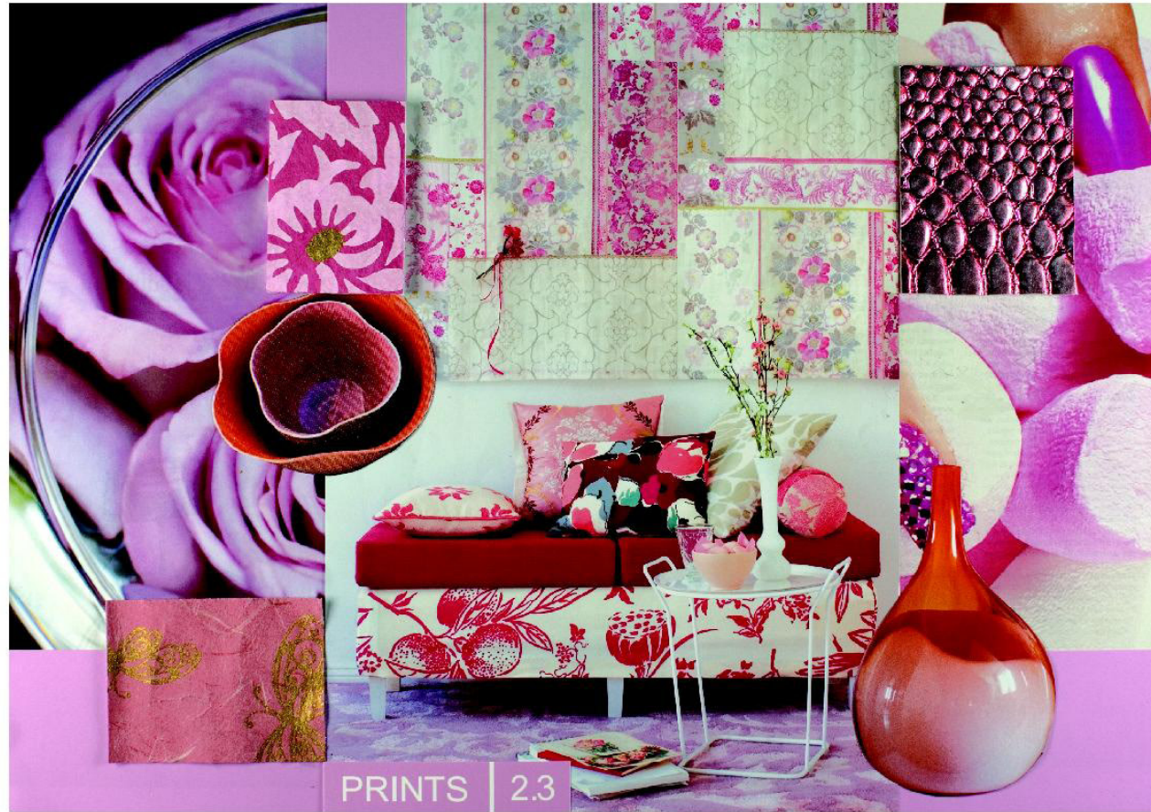
PRINTS | 2.3

2.3 - These pink prints are all based on pretty florals and butterflies. We see traditional rose prints, but also more with a painterly