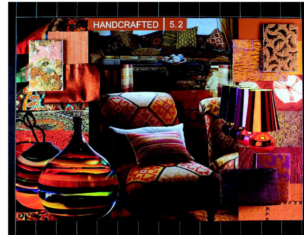
HANDCRAFTED | 5.2