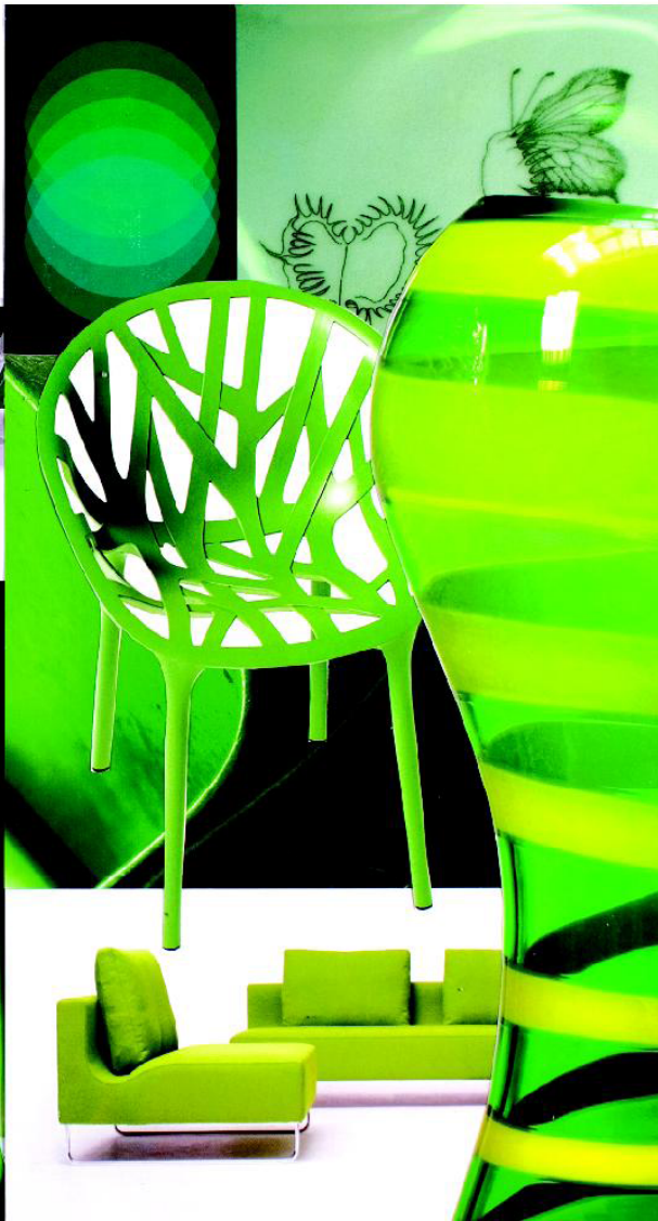
4.8 - In almost all style directions we notice that green takes an important place. Also in this contemporary direction that is the case. Not only green as a colour, but also produced in a responsible way, considering our environment. Sofa's offer the choice of different organic shapes as rest pieces. Alternate shape, colour and cover materials. "The Vegetal chair" is developed for Vitra.