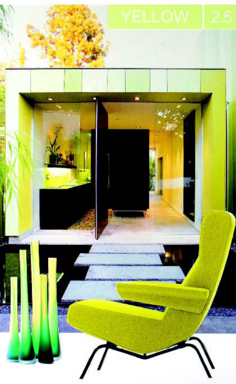
YELLOW | 2.5

or a-symmetrical. The metallic reptile print in vinyl on the right is from award-winning Israeli company Nachick.