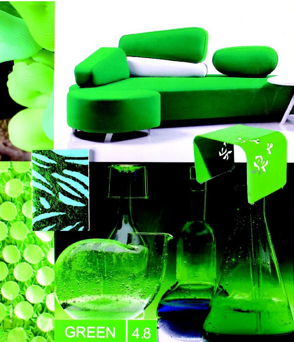
GREEN | 4.8